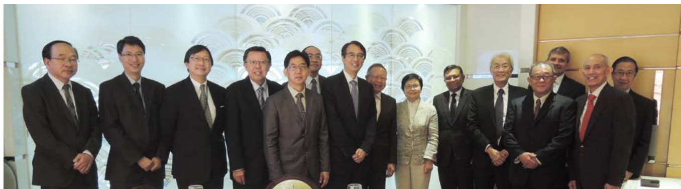
Hong Kong PSC Visit