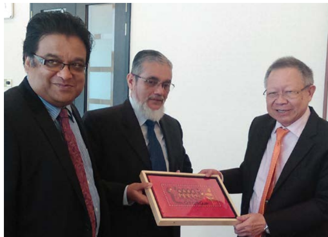
Bangladesh PSC visit