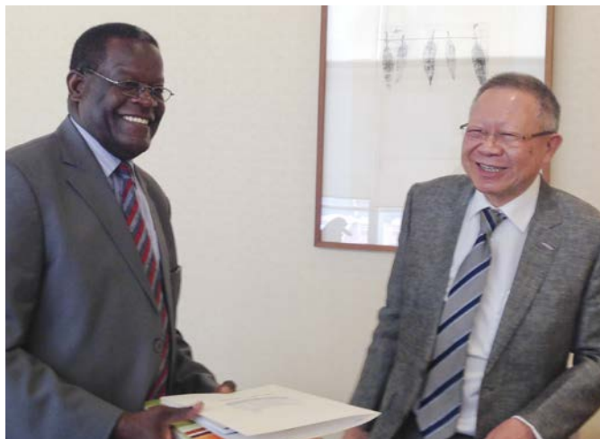
Namibia PSC visit

The PSC hosted delegations from the Namibia and Bangladesh Public Service Commission when they visited Singapore on 15 October 2014 and 2 December 2014 respectively.